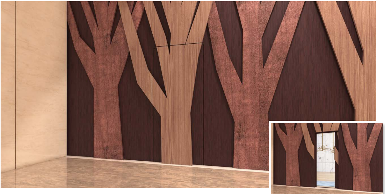
[Top Hung Sliding System]