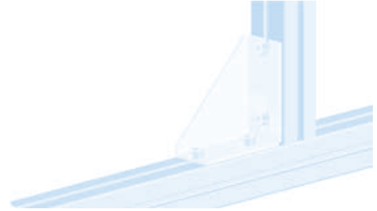
Stahlwinkel 45/100 Steel Connection Angle 45/100